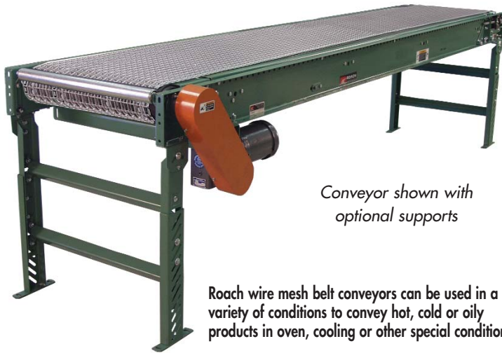
Conveyor shown with optional supports

Roach wire mesh belt conveyors can be used in a variety of conditions to convey hot, cold or oily products in oven, cooling or other special conditions.